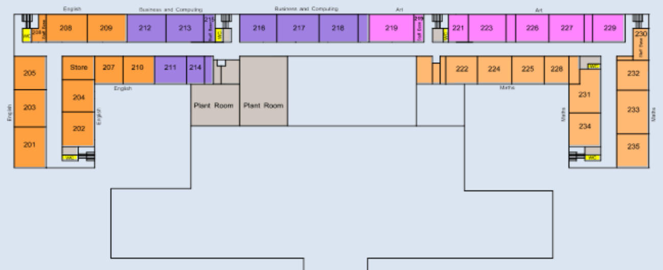
33 Second Floor