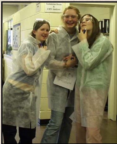
Girls Get Set