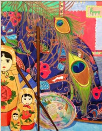
Worldwide Gifts By Elizabeth Case

In curricular attainment 5-14 English and Maths assessments are above target level and above National and Highland averages. Standard Grade pass rates continue to be above or broadly in line with National average and in 2004 there was a marked improvement in Standard Grades with pupils gaining 5 or more Foundation awards and those pupils gaining 5 Credits or better. The number of pupils achieving one Higher rose from 37% to 49% and those attaining three Highers rose from 25% to 28%. The number of pupils gaining five or more Highers has stabilised at the improved level of around 12% and is above both Highland and National levels. The school is now very well provided with ICT and this is linked to the curriculum to give pupils appropriate opportunities to learn.